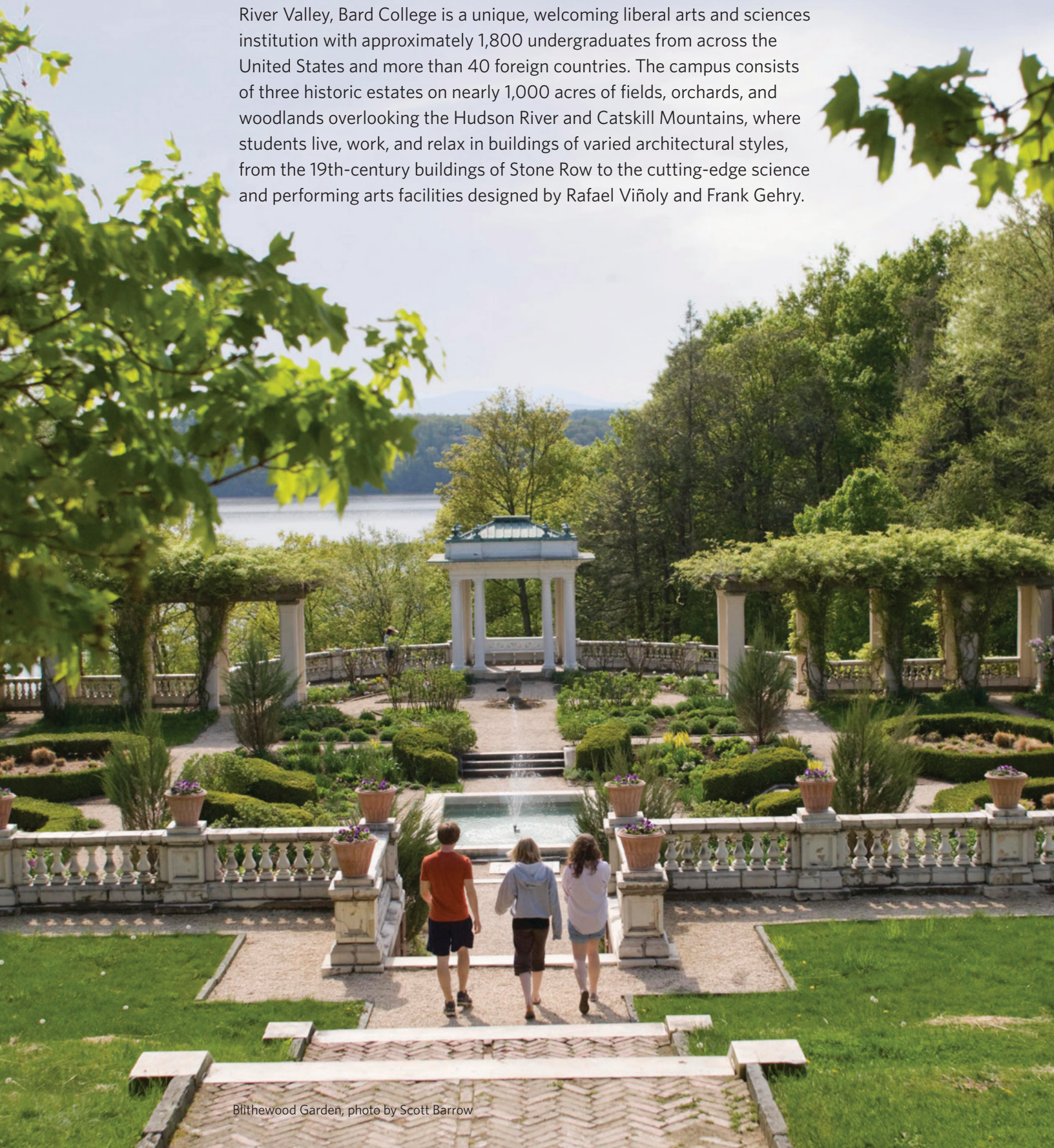
Blithewood Garden, photo by Scott Barrow

Located about 90 miles north of New York City in the beautiful Hudson River Valley, Bard College is a unique, welcoming liberal arts and sciences institution with approximately 1,800 undergraduates from across the United States and more than 40 foreign countries. The campus consists of three historic estates on nearly 1,000 acres of fields, orchards, and woodlands overlooking the Hudson River and Catskill Mountains, where students live, work, and relax in buildings of varied architectural styles, from the 19th-century buildings of Stone Row to the cutting-edge science and performing arts facilities designed by Rafael Viñoly and Frank Gehry.